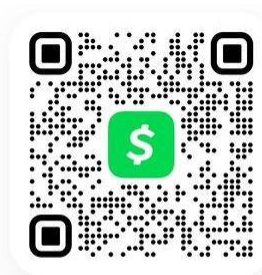
Roots PAC Scan to pay $pacroots

NOTE: On-site childcare will not be provided. Light refreshments will be served!